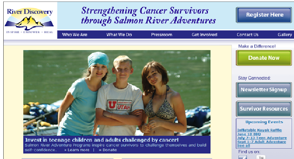
River Discovery Home Page

He put many hours into the site design and code and you will agree that the finished product is beautiful.